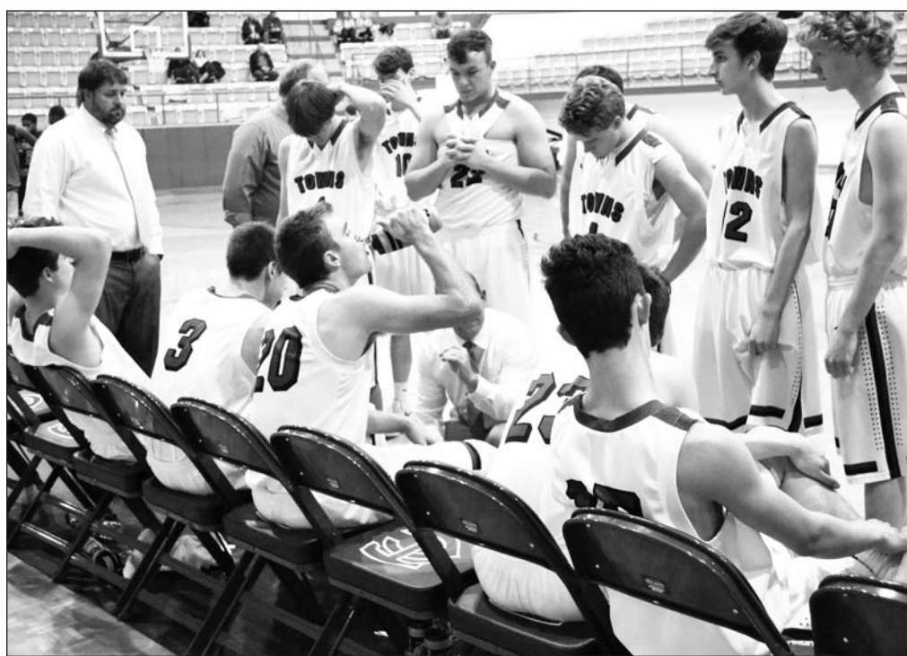
huddle during a timeout vs Riverside Military Academy.